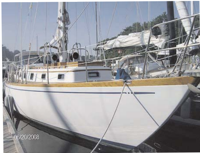
RisingTides has a support boat