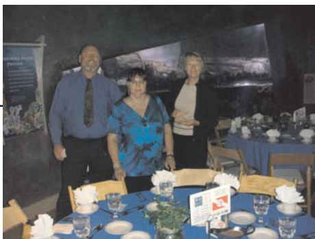
AVDD members enjoy the Chamber Day Evening Dinner