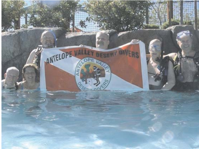
AVDD at Dry Town's "Lazy River"