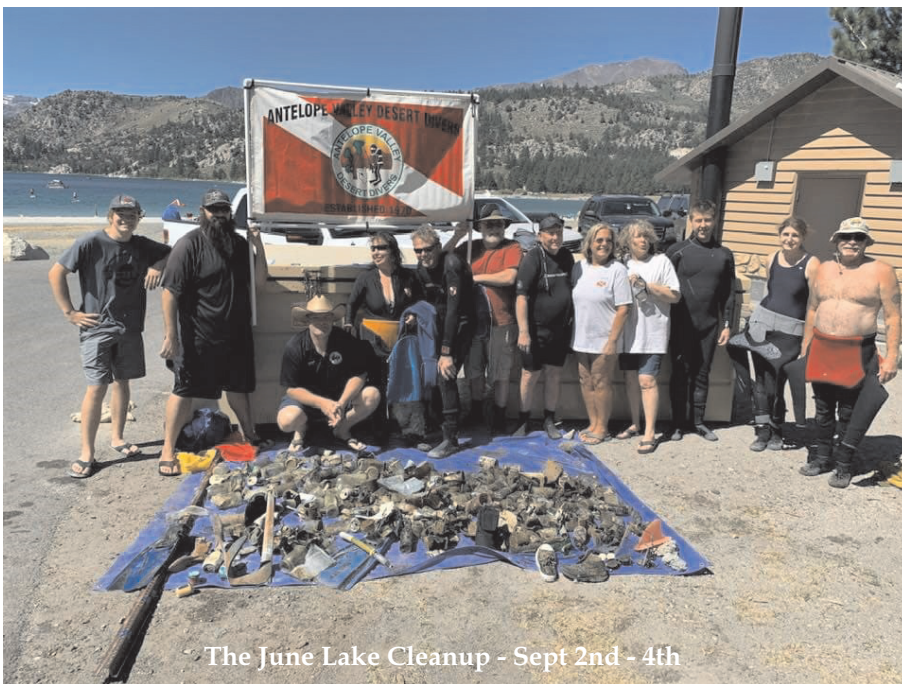
The June Lake Cleanup - Sept 2nd - 4th