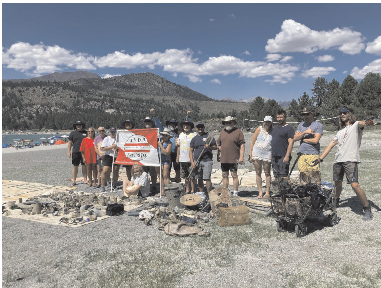
The June Lake Cleanup - Sept 2nd - 4th