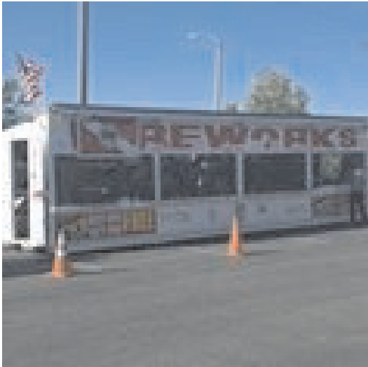
Fireworks Booth was a record setting year for the club. Thanks to all that helped!