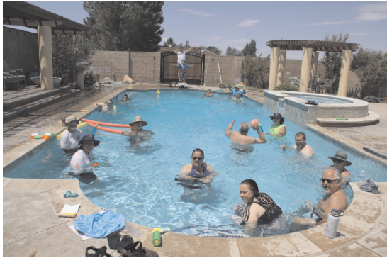
Pool Party on the 10th of July