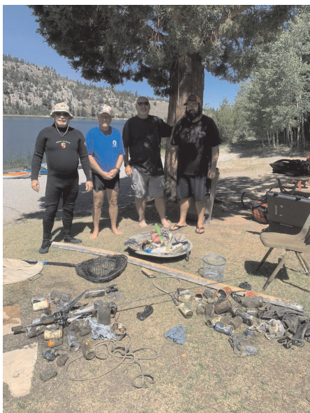
June Lake Cleanup Sept 4-6th