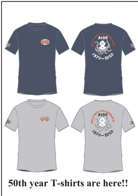
50th year T-shirts are here!!