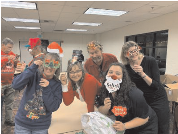
Potluck Dinner & Yankee Swap