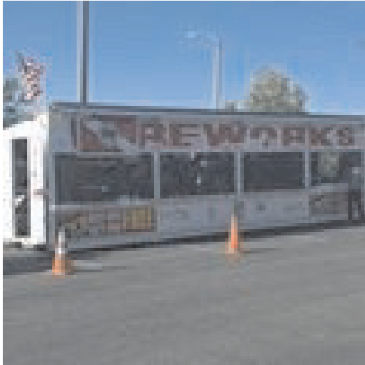
Fireworks Booth - June 28 - July 4th