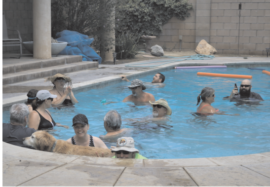
Pool Party on the 10th of July