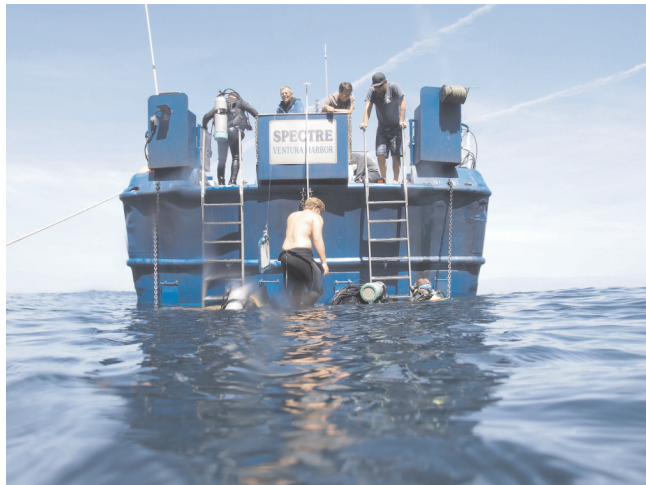
Spectre - Lobster Dive on Saturday 3/14