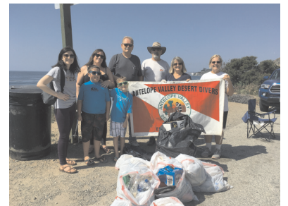
50 Years of Cleanups Makes a Difference