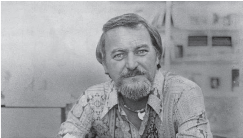
Clive Cussler died on 2/24 at his home in Scottsdale, Ariz.