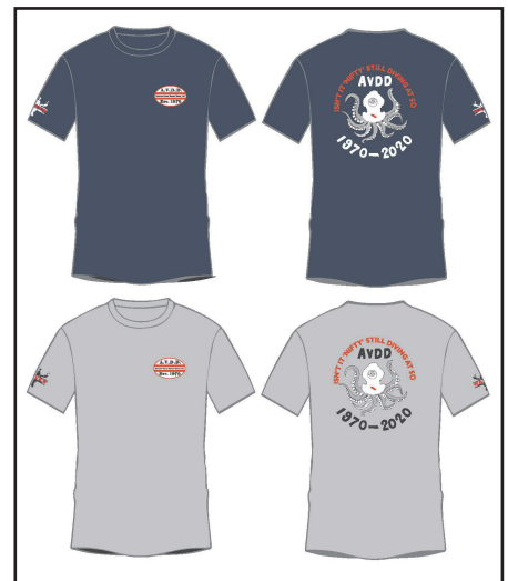
50th year T-shirts are here!!