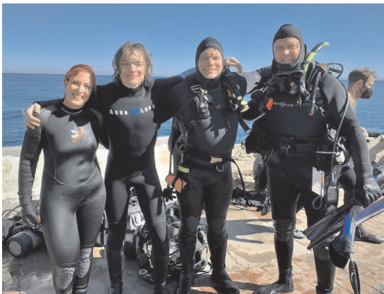
Diving Catalina Again