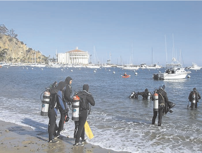
Catalina Cleanup is Feb 25th