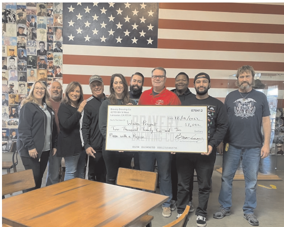
Bravery Brewery writes a check for WAVES