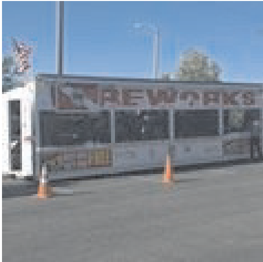
Fireworks Booth was a record setting year for the club. Thanks to all that helped!