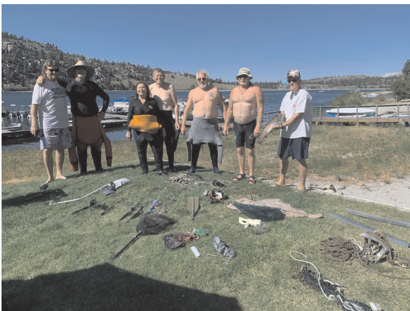
June Lake Clean-up - Sept 4,5,6th Good Times