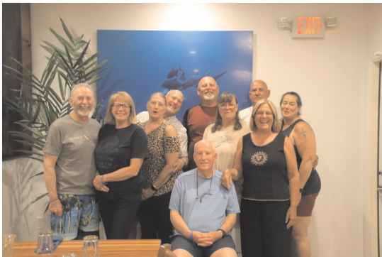
The club trip to Little Cayman Island was "World Class Diving"