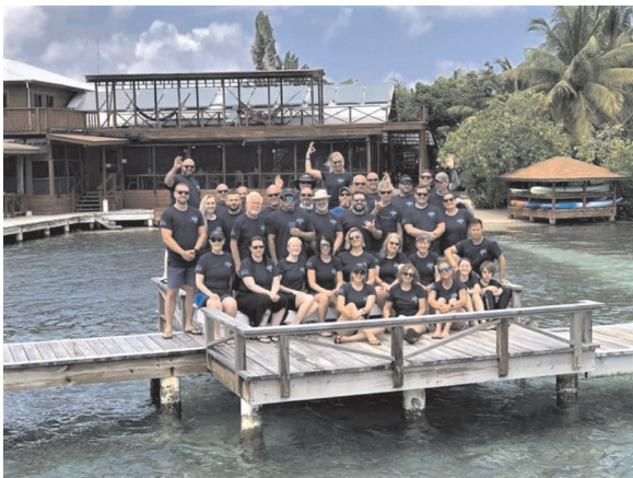
Waves on Roatan Island