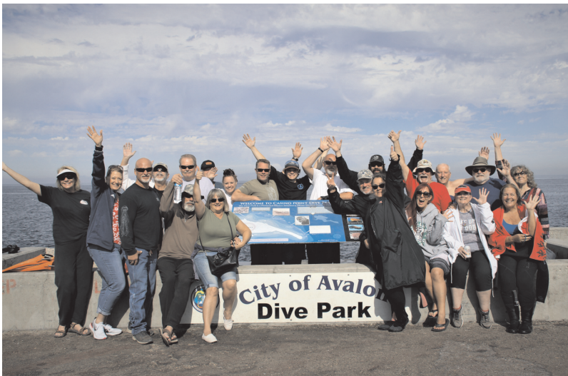
Catalina Fall Dive November 6th - 9th