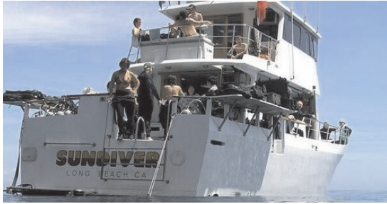
Sundiver Express to Catalina