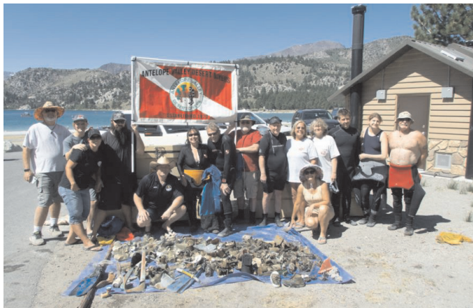
June Lake Clean-up Sept 4,5,6th